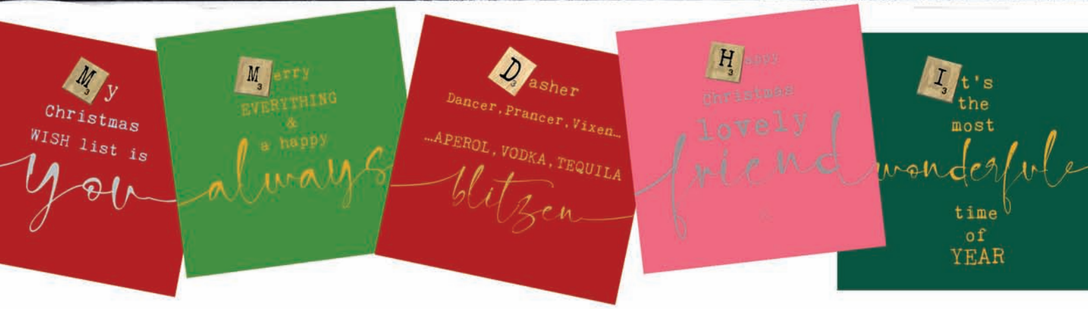
24 <u>new</u> Christmas Inky Scripts

order onine @ www.bexyboo.co.uk email enquiries@bexyboo.co.uk